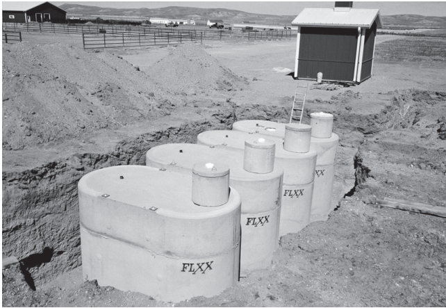
Four mated 3600 gal. cisterns (14,400g total) for agricultural use.

Other mated cistern configurations are available. Contact FRPC sales for details.