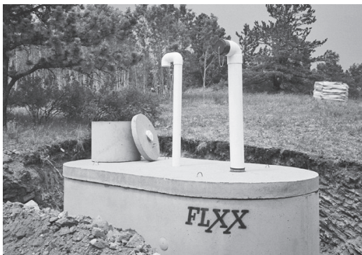
Dry hydrant storage tank before back-fill.